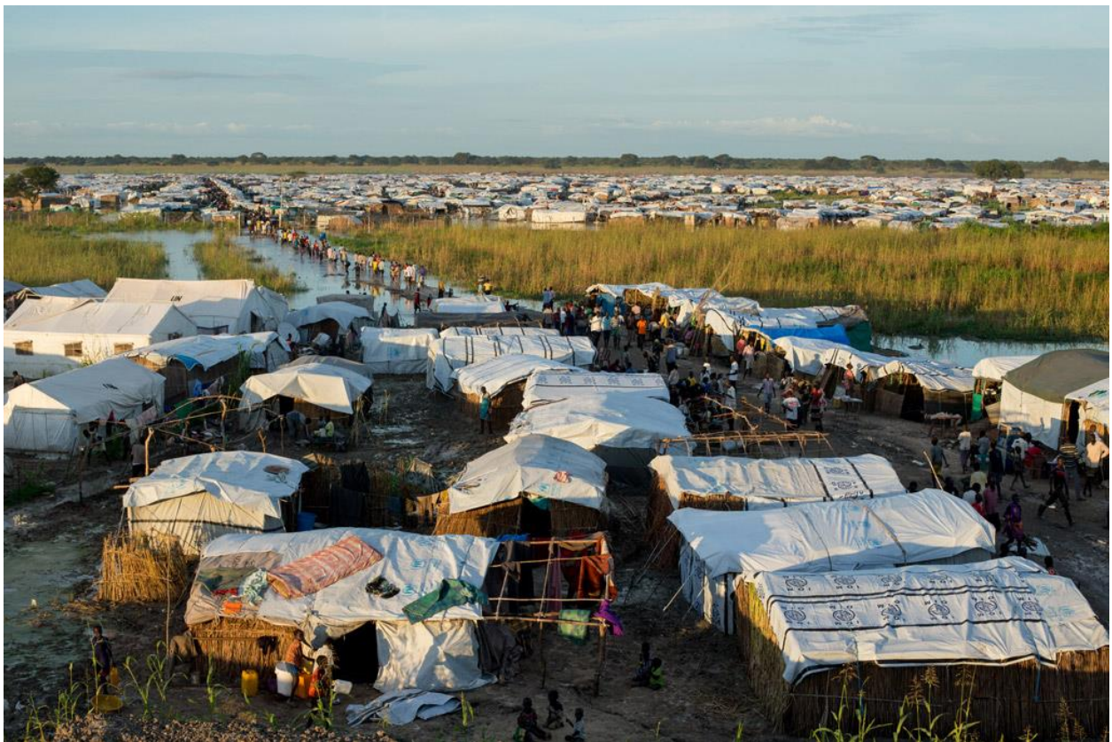
The Protection of Civilians (PoC) site near Bentiu in Unity State, South Sudan, 2014.