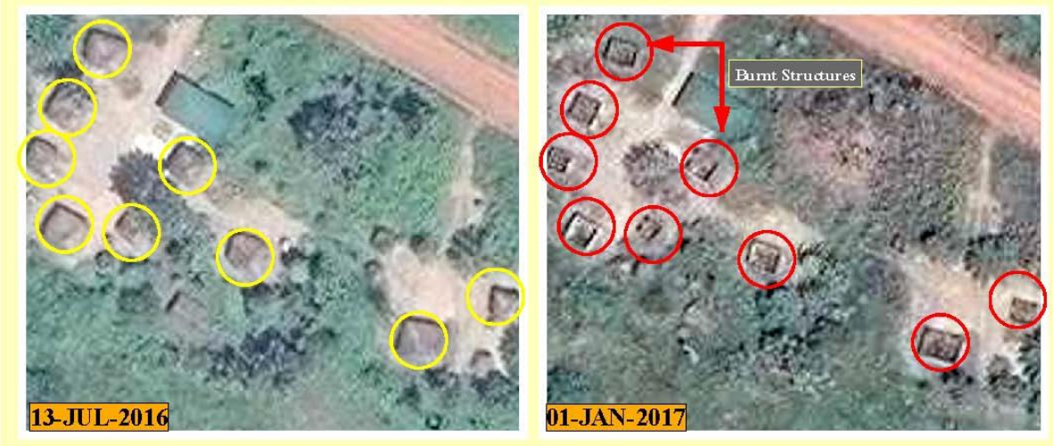
Analyzed WorldView-3 imagery captured on 13-Jul-2016 and imagery captured 01-Jan-2017; Multiple burned structures, including both circular and rectangular traditional houses, are present with the ground between them remaining unburnt.

60. On 16 January 2017, a militia alleged to be affiliated with SPLA, reportedly burned down at least 14 houses in Lutaya, approximately five kilometers from Yei town, and the Diocesan Pastoral Centre in the Parish of Saint Joseph on the Yei–Aba road. According to a source, buildings belonging to the church in six parishes in the area had been destroyed in violence since July 2016.