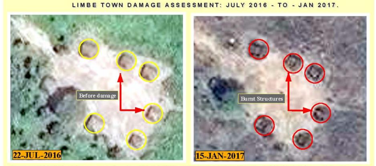
Analyzed WorldView-2 imagery captured on 22-Jul-2016 and imagery captured 15-Jan-2017; Multiple burned structures, including both circular and rectangular traditional houses, are present with the ground between them remaining unburnt.

60. On 16 January 2017, a militia alleged to be affiliated with SPLA, reportedly burned down at least 14 houses in Lutaya, approximately five kilometers from Yei town, and the Diocesan Pastoral Centre in the Parish of Saint Joseph on the Yei–Aba road. According to a source, buildings belonging to the church in six parishes in the area had been destroyed in violence since July 2016.