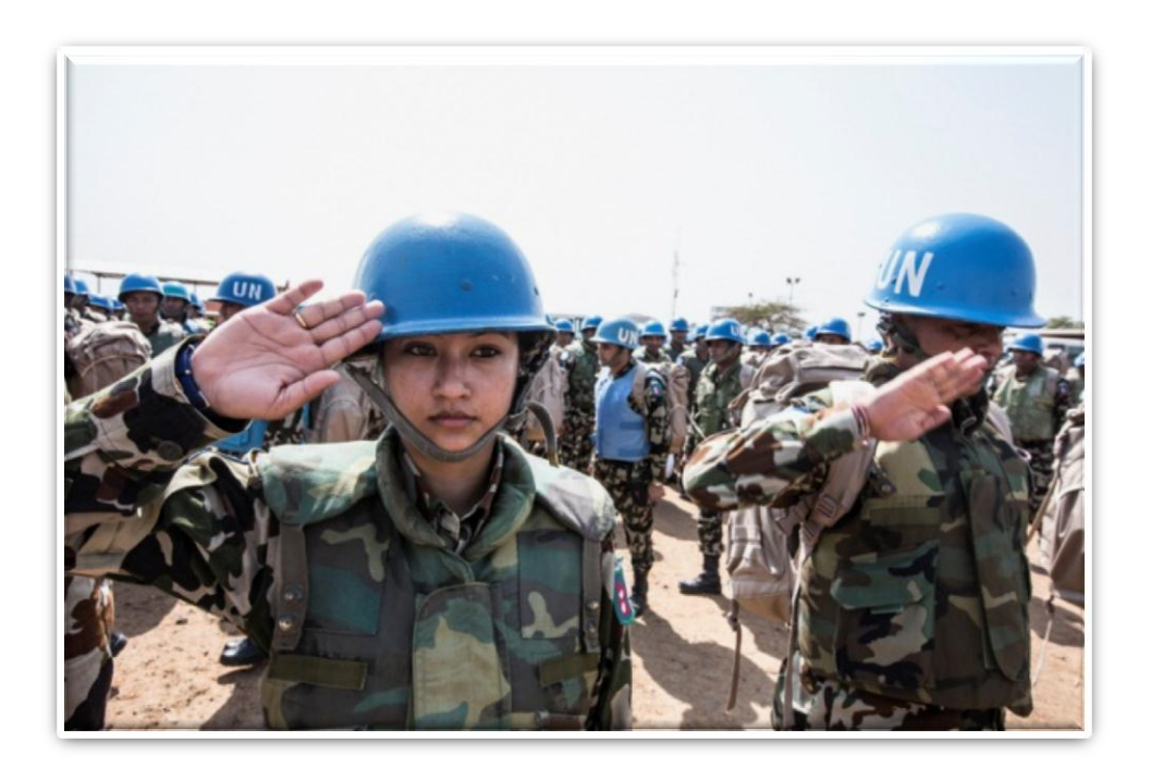
Military reinforcements from Nepal include 10 female troops (UNMISS Photo: Billy Isaac)

On 4 February, a contingent of 266 peacekeepers from Nepal arrived in South Sudanese capital, as part of the inter-mission cooperation. Troops include 10 women troops, two of which are