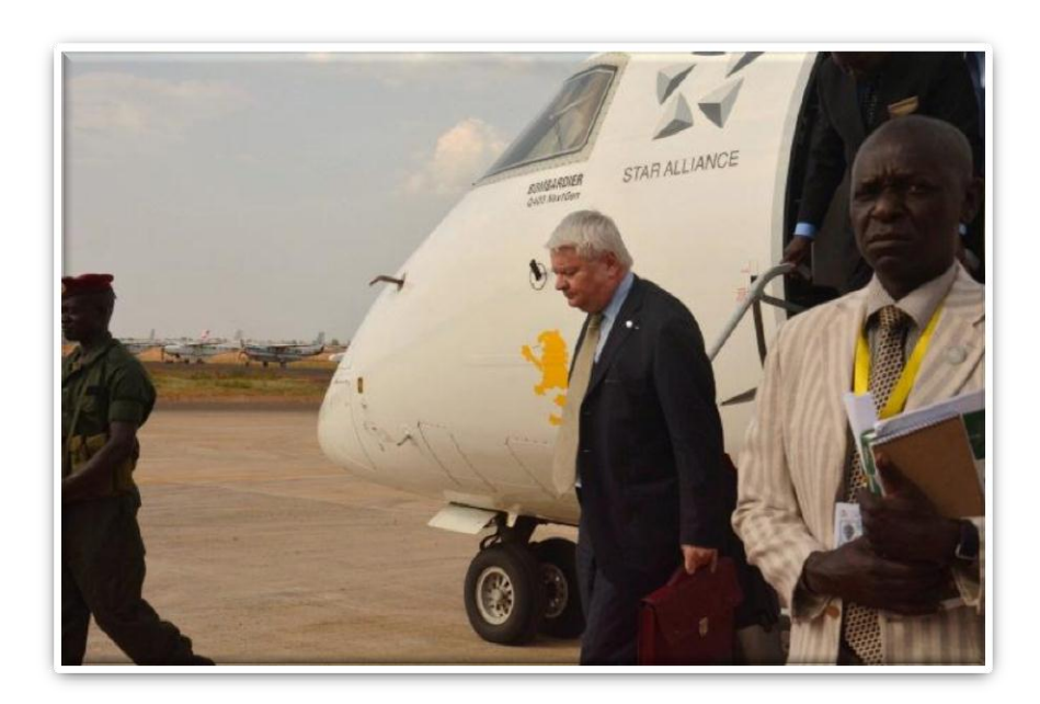
Herve Ladsous arriving at Juba International Airport 2 February, 2014

On 3 February, Hervé Ladsous, the United Nations Under-Secretary-General (USG) for Peacekeeping Operations concluded a two-day visit to Juba, South Sudan. The USG had previously attended the African Union summit in Addis Abeba.