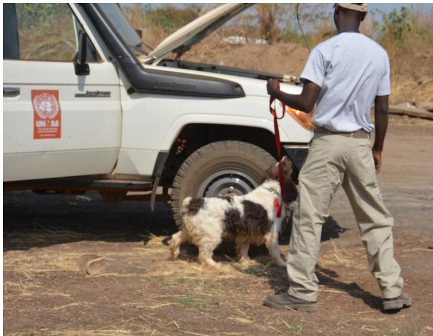
Sniffers Dog (UNMISS: Shantal Persaud)

http://www.unmiss.unmissions.org/Default.aspx?tabid=3465&ctl=Details&mid=6047&ItemID=3092762&language=en-US