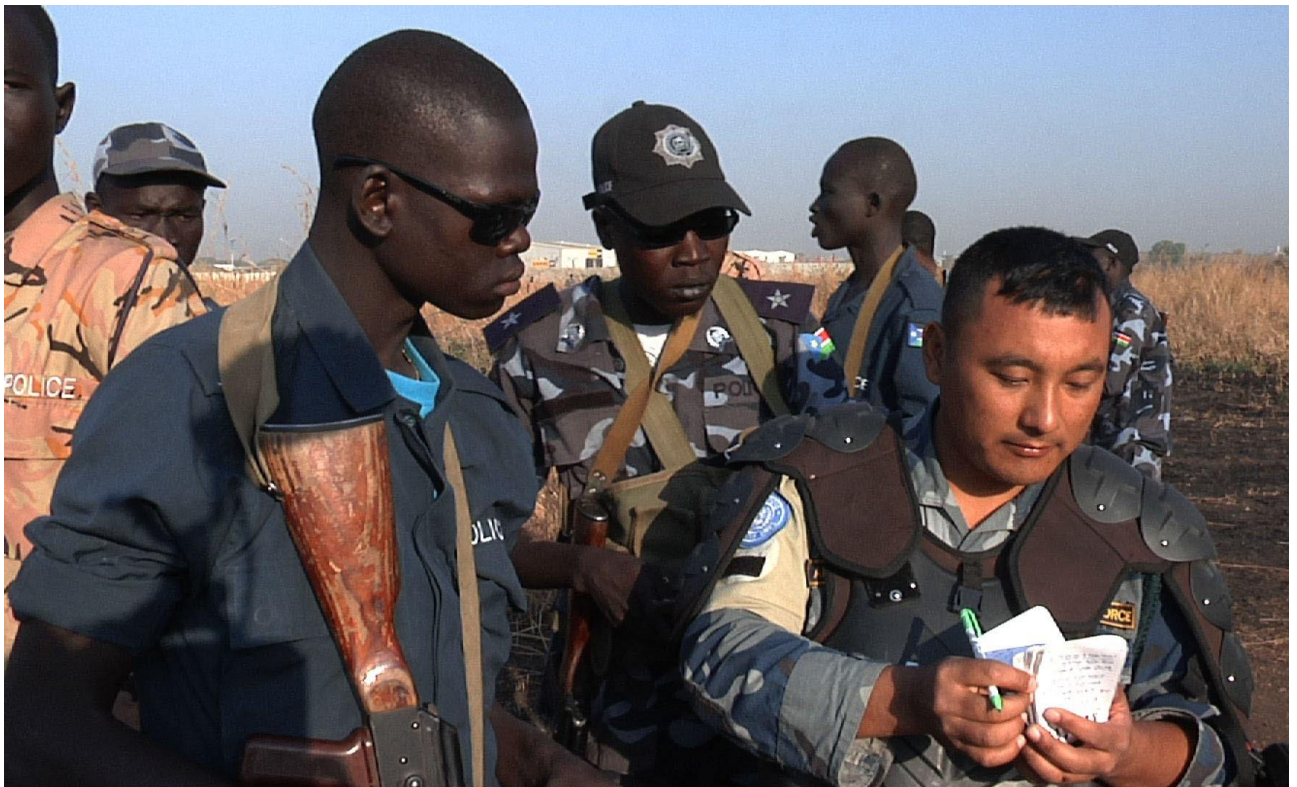
SSNPS supported by UNPOL searching outside UNMISS protection of civilians site

http://www.unmiss.unmissions.org/Default.aspx?tabid=3465&ctl=Details&mid=6047&ItemID=3097681&language=en-US