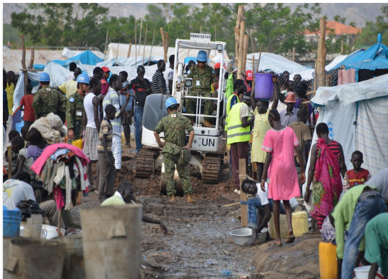
Drainage project in Juba (Toming) protection site