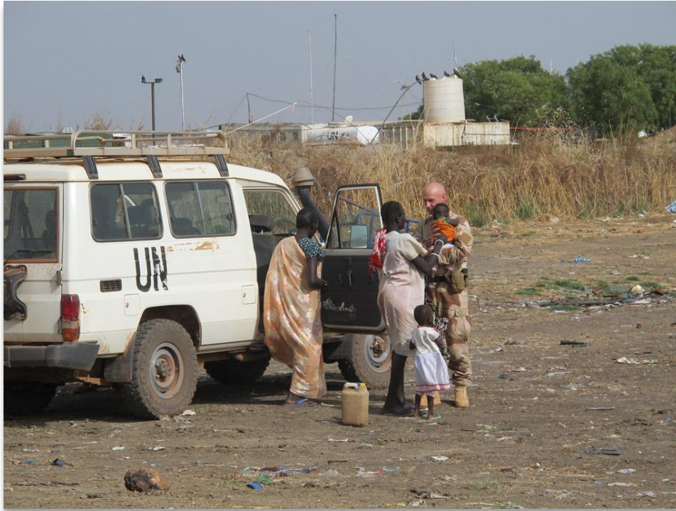
UNMISS assists in relocation of IDPs in Unity State.