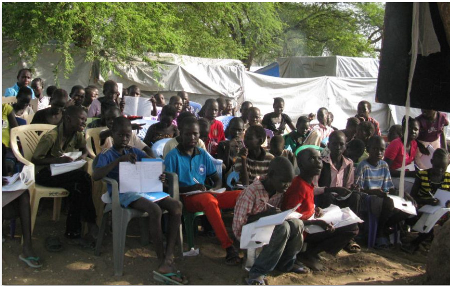
Emergency School in Bor PoC site