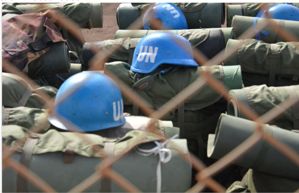
UNMISS Reinforcements land in Juba.