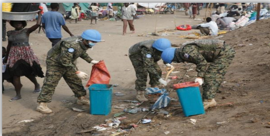
UNMISS Korean Engineer Company cleans up the PoC site in Bor