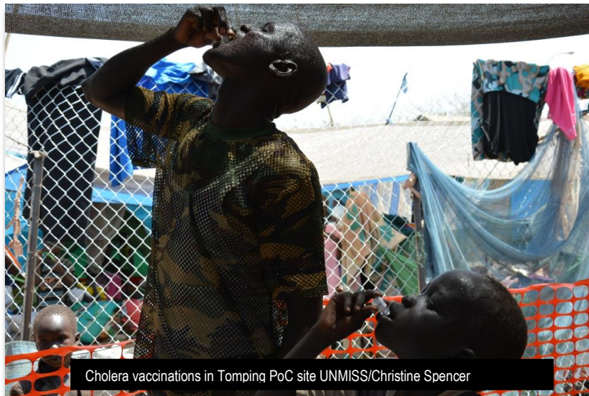
Cholera vaccinations in Topping PoC site