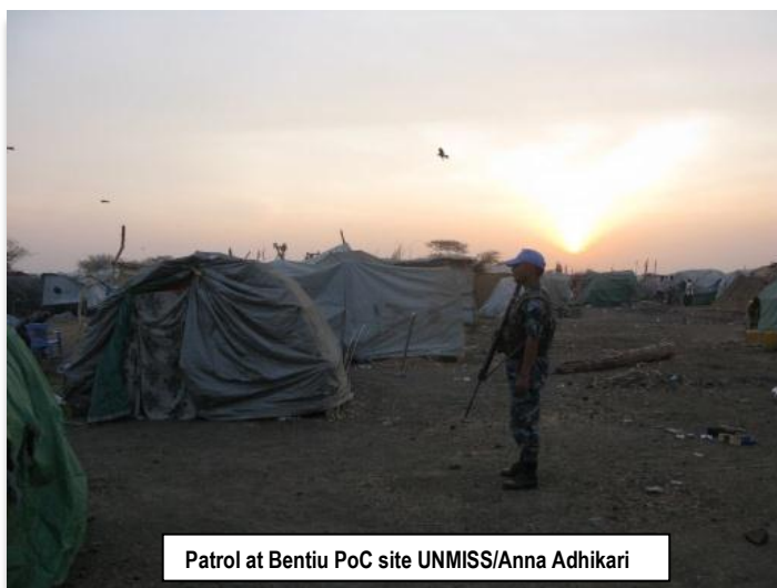
Patrol at Bentiu PoC site

required help in leaving the Christ the King Roman Catholic Church compound in Malakal Town.