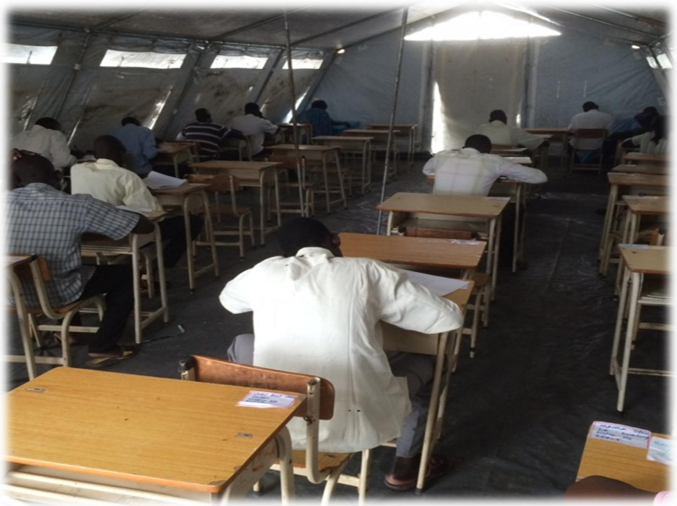
Students in Malakal protection of civilian's sites siting final grade examination

For further information or media enquiries,